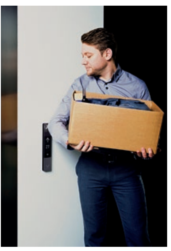
Large, clear landing call buttons for ease and convenience.